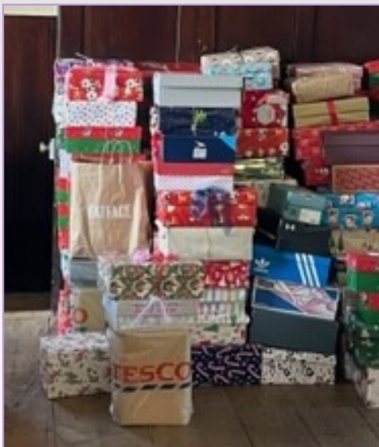
SYRESHAM'S GENEROUS GIFTS OF OVERSEAS AID

VILLAGE OF THE YEAR 2008-10, 2012, 2013, 2015, 2017