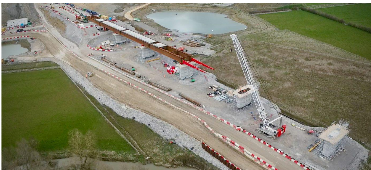
Figure 1: The photo above shows Westbury Viaduct under construction.

The 320-meter-long Westbury viaduct, near Brackley, is designed to carry the railway over the River Great Ouse floodplain. It will be supported by seven evenly spaced piers, each up to 9.2 meters tall. This impressive viaduct is one of 50 major viaducts on the HS2 project, of which, EKFB is building 15. Impressively, the design and build of this viaduct has cut embedded carbon by an estimated 60%.