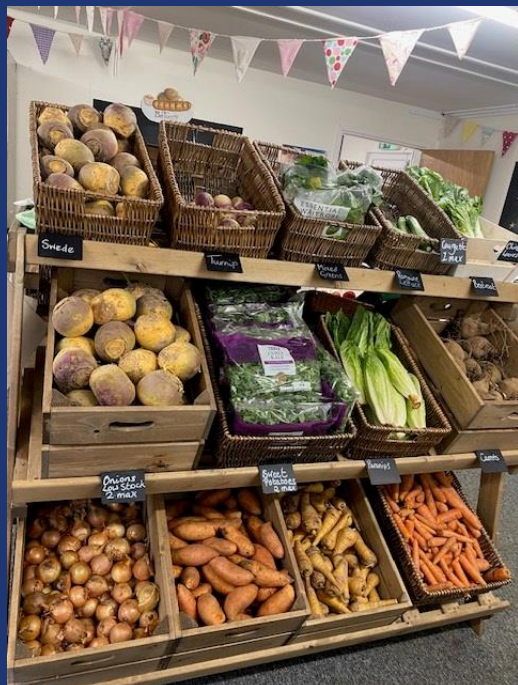
Figure 5: The image above shows the Northants Food Larder, February 2024.

As part of supporting local communities and in collaboration with the food larders in Northamptonshire, we have recently assisted with the collection and delivery of donations.