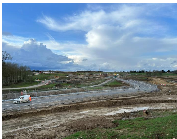
Figure 3: The image above shows the new Radstone Road Temporary Diversion, March 2024.

A: Yes. Once the new overbridge has been constructed, we will need to remove the temporary diversion and tie in the new permanent overbridge to the road network. These works are expected to take place in 2025 and will require full overnight road closures. We will update communities as our works progress.