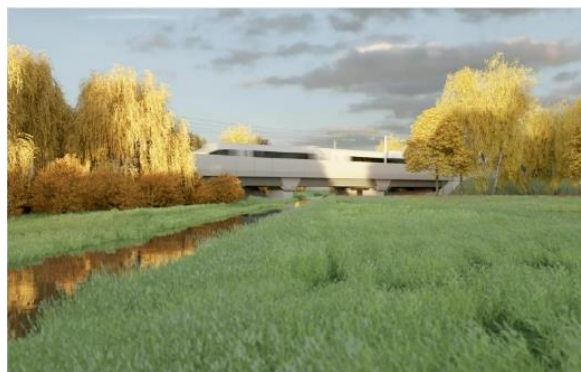
Figure 4: View of south abutment of Godington Viaduct and diverted Padbury Brook.

This spring our teams also began the installation of the steel structure and formwork for the bridge deck of the CHW/18 Overbridge. Work for the bridge deck is expected to take place this summer. This overbridge is expected to be completed in late 2024.