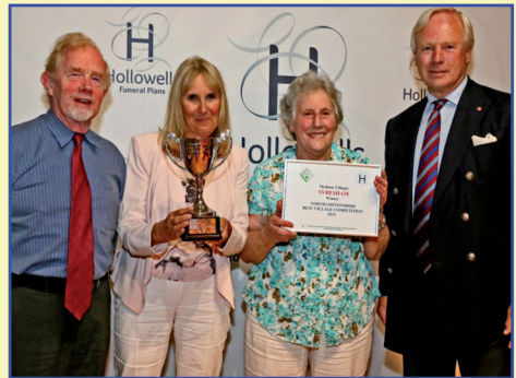
2015 Village of the Year Award