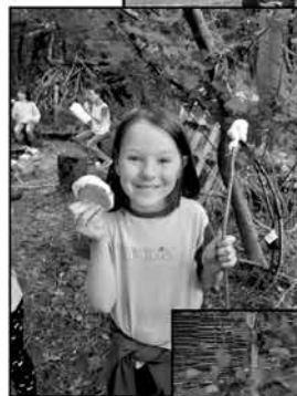
BEST EVER MARSHMAL- LWS!