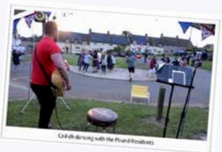
Celish dancing with the Pound Residents