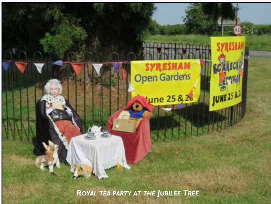
ROYAL TEA PARTY AT THE JUBILEE TREE

VILLAGE OF THE YEAR 2008-10, 2012, 2013, 2015, 2017