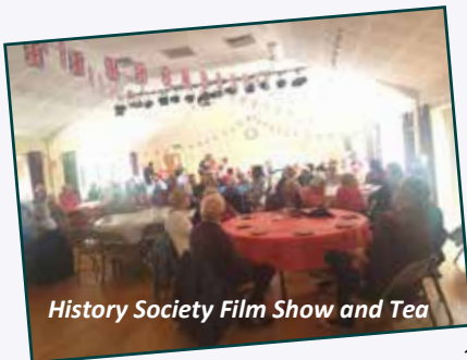
History Society Film Show and Tea