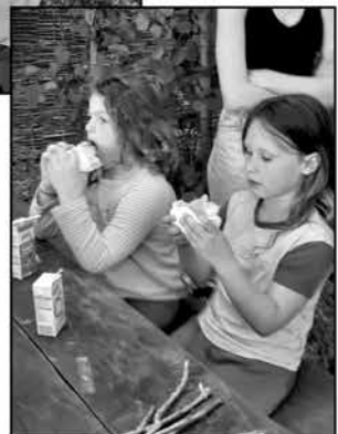
BEST TREATS OUTDOORS!