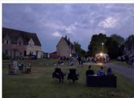
End of a great Party in The Pound